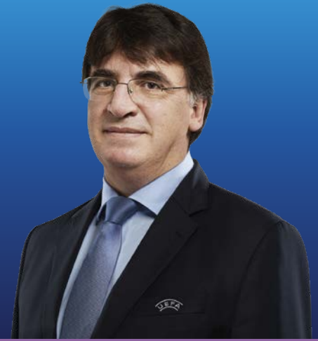
Theodore Theodoridis UEFA General Secretary

By acknowledging their support for research projects, they ensure that their practical value is maximised and that the results ultimately benefit European football as a whole.