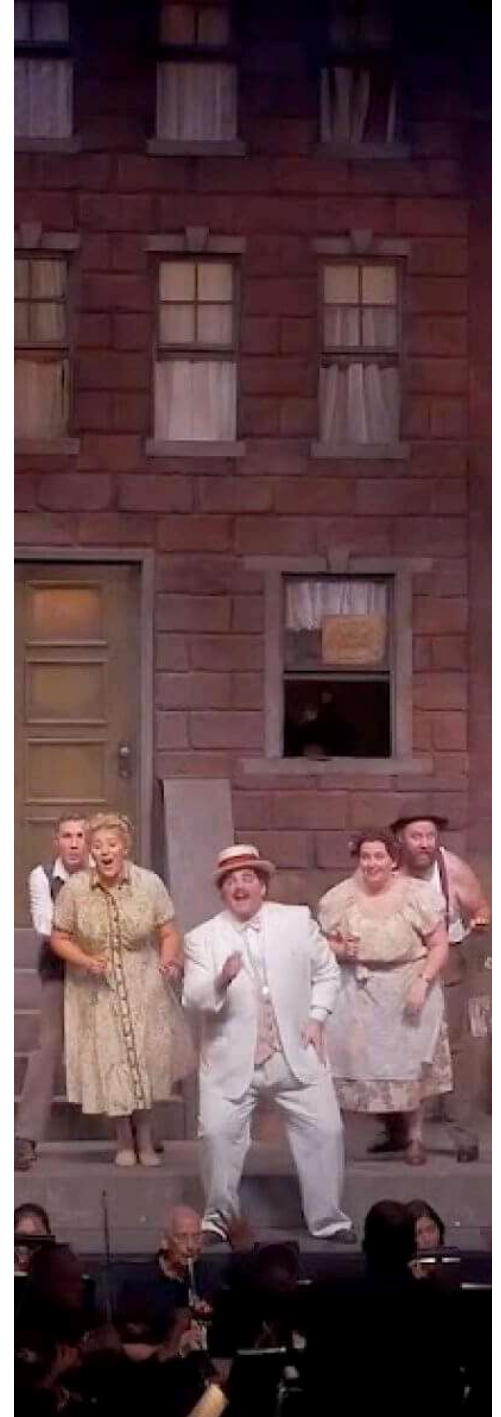
Street Scene by the Janiec Opera Company of the Brevard Music Center, part of a sponsored summer-long Kurt Weill festival.